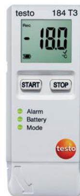
testo 184 T3