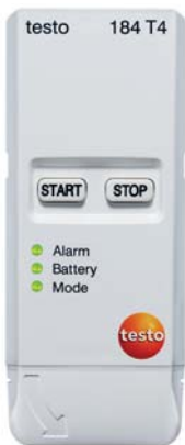
testo 184 T4