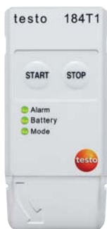
testo 184 T1