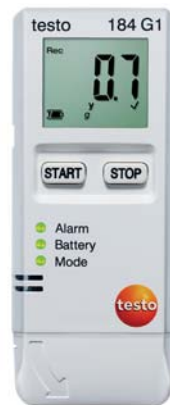
testo 184 G1