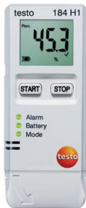
testo 184 H1