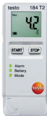
testo 184 T2